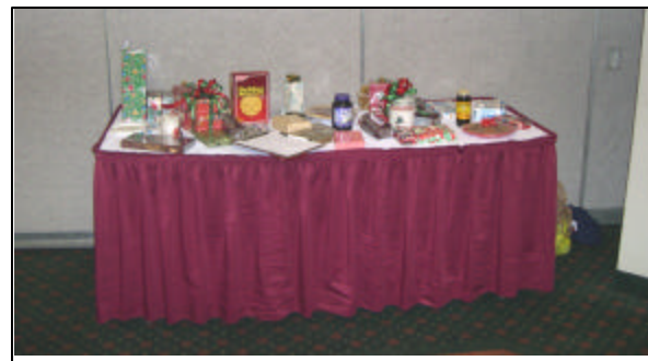
Above: Members and guests; Alzheimer's raffle table