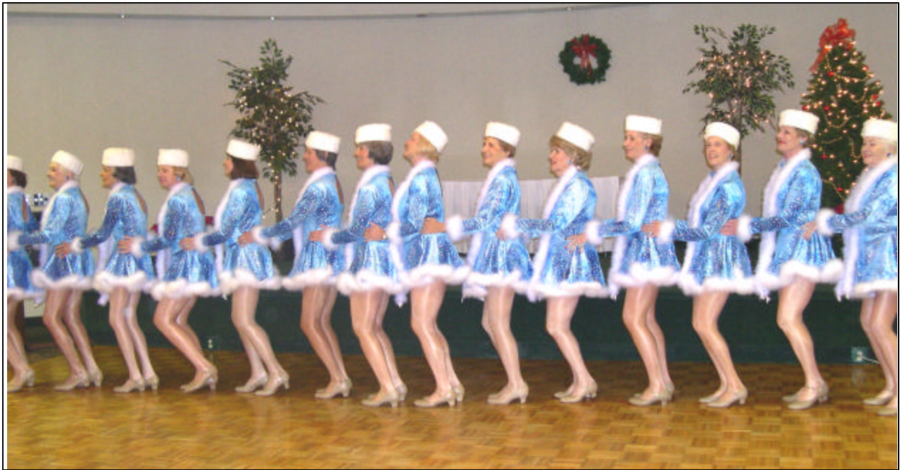
Pictures above: December 12th 'eating meeting' members, guests and Sophisticated Ladies